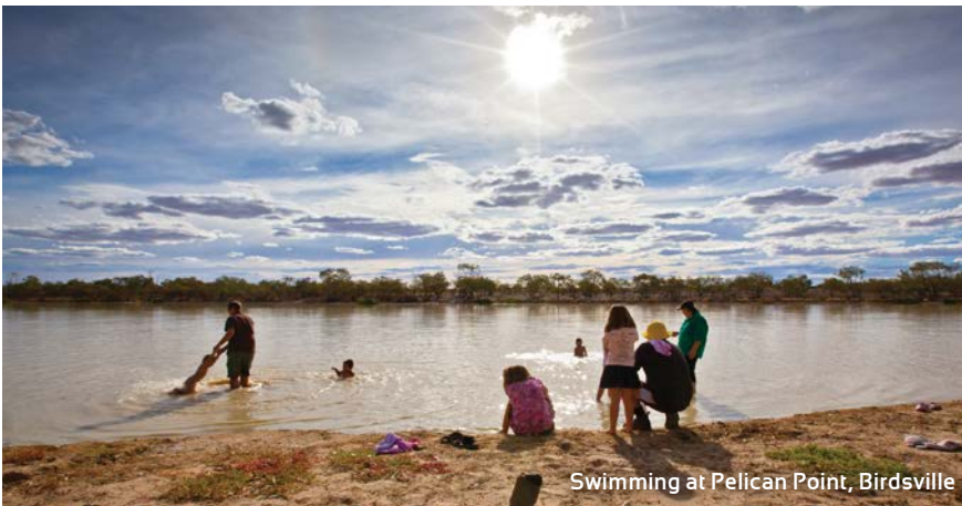
Swimming at Pelican Point, Birdsville