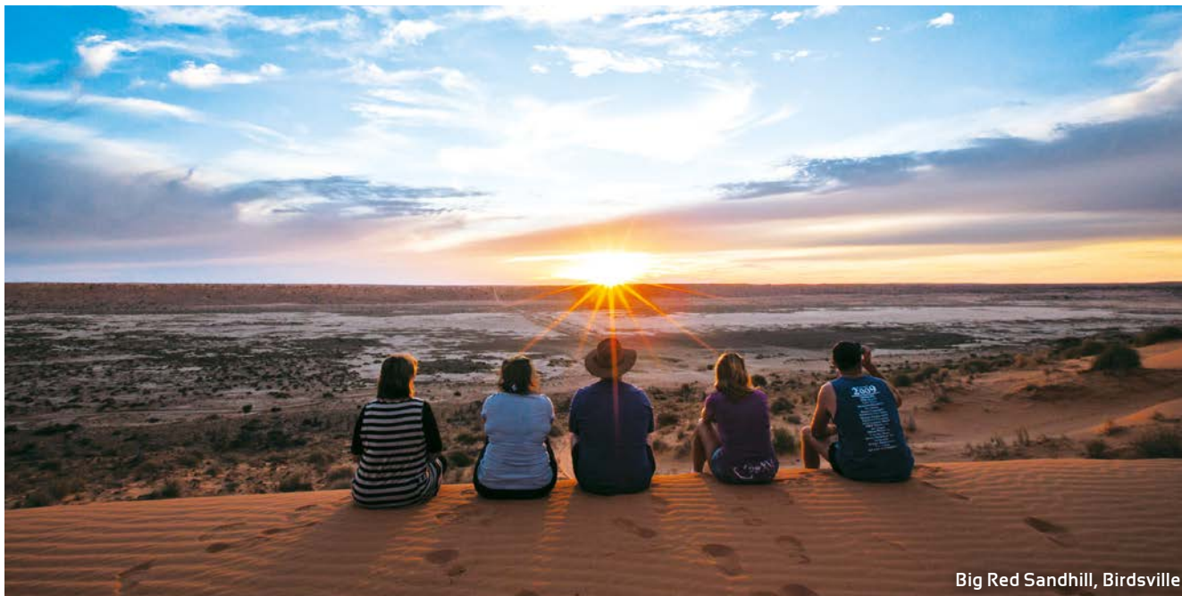
Big Red Sandhill, Birdsville

Accommodation: Innamincka Trading Post, Innamincka. Ph: (08) 8675 9900