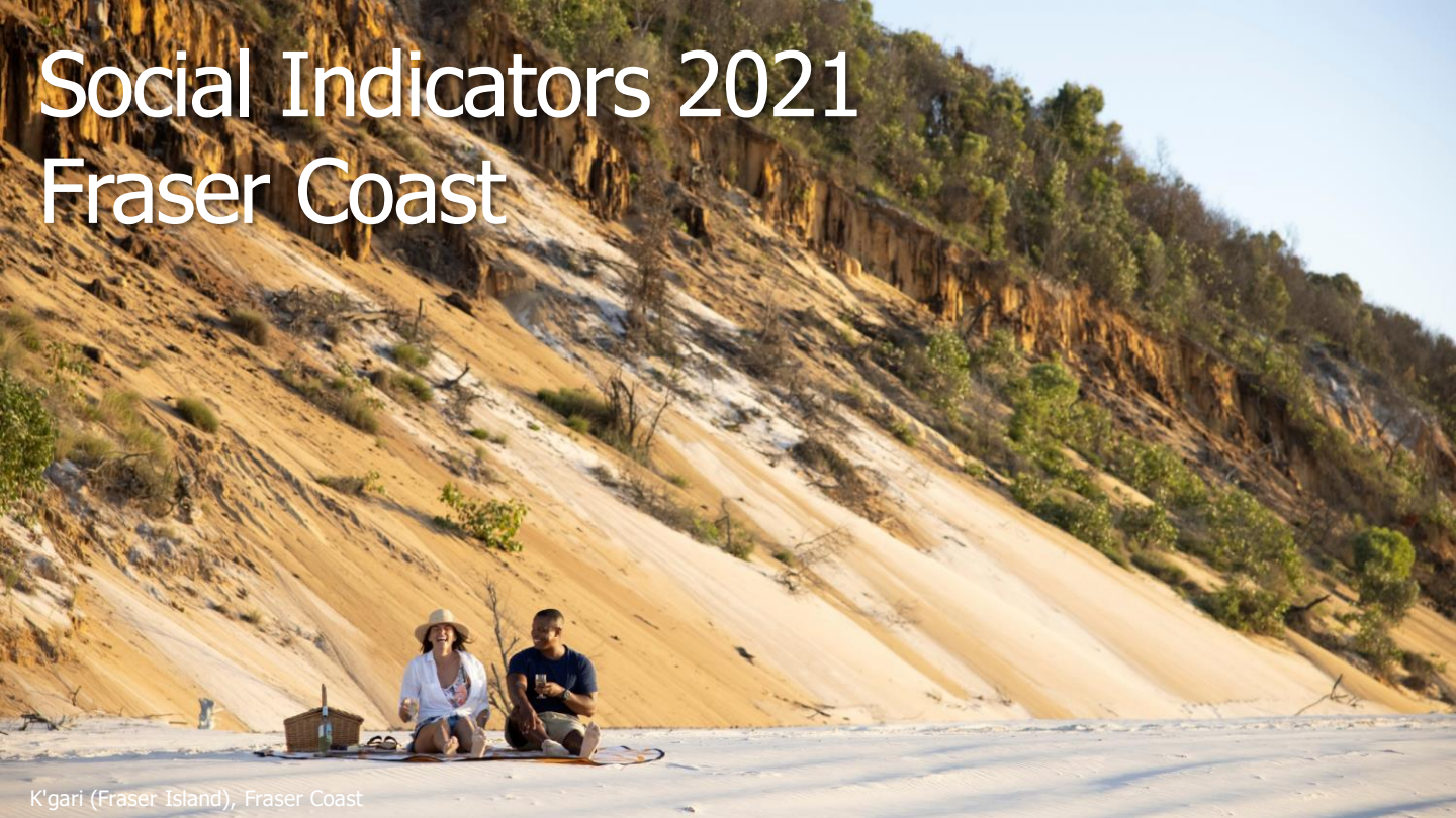
K'gari (Fraser Island), Fraser Coast