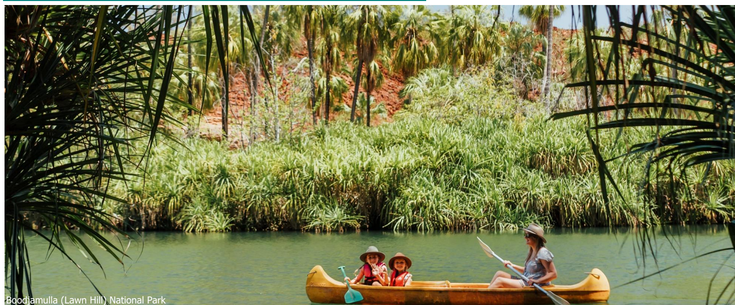
Boodjamulla (Lawn Hill) National Park

The tourism regions are defined by the Australian Bureau of Statistics (ABS) as a collection of Statistical Area Level 2s (SA2), please refer to the interactive map at http://stat.abs.gov.au/itt/r.jsp?ABSMaps