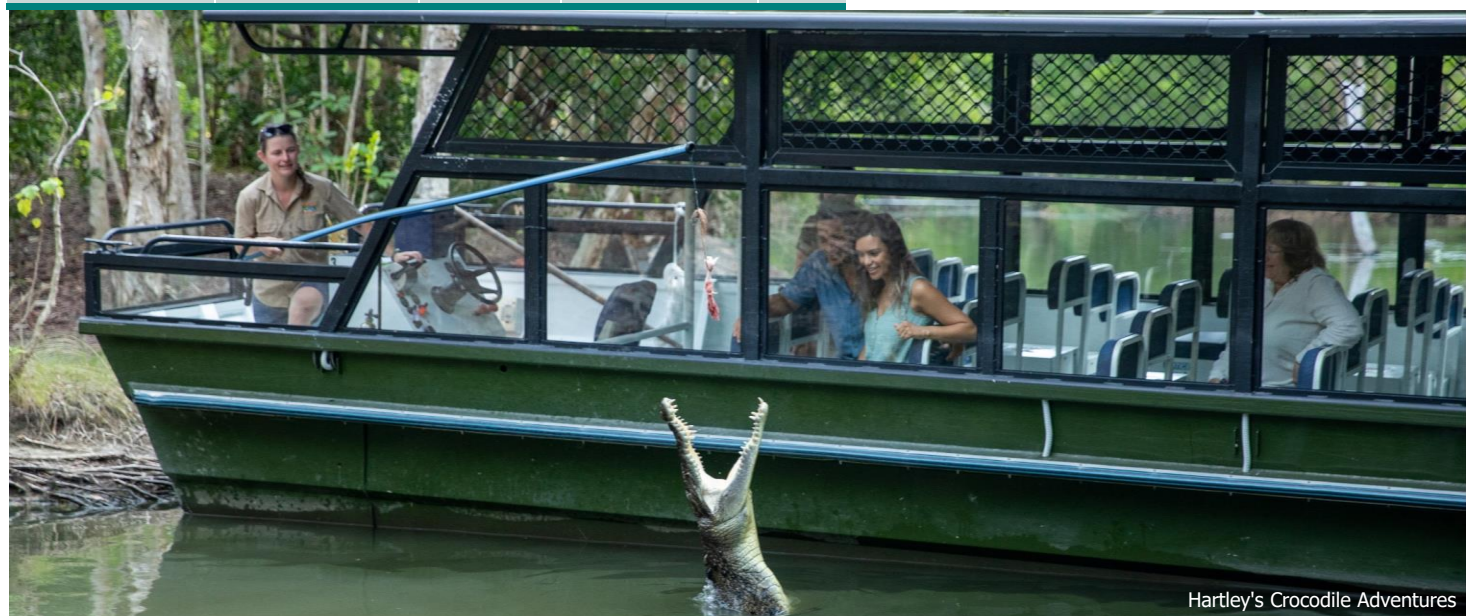
Hartley's Crocodile Adventures

Regional snapshots for all Queensland regions are available on the TEQ website. Overview snapshots are also available for both domestic and international visitors. www.teq.queensland.com . If you have any questions or comments, please email research@queensland.com . For tourism region definitions, please see https://www.tra.gov.au/Regional/tourism-regions .