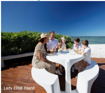
Lady Elliot Island