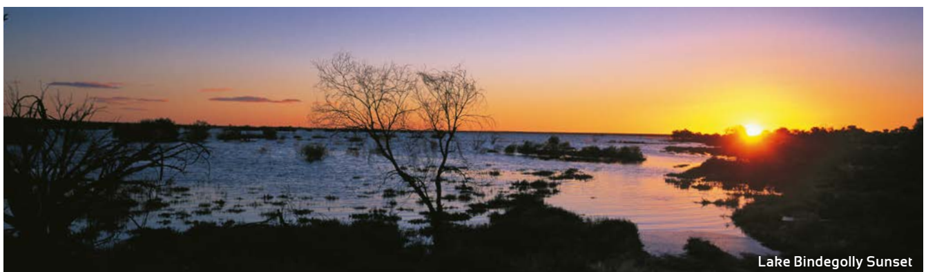
Lake Bindegolly Sunset